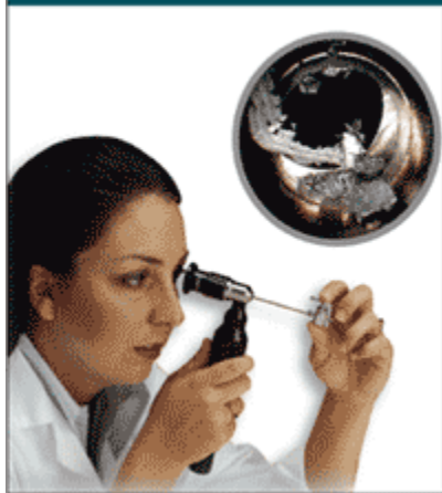
Figure 4: Viewing Chips Inside a Miniature Precision Valve